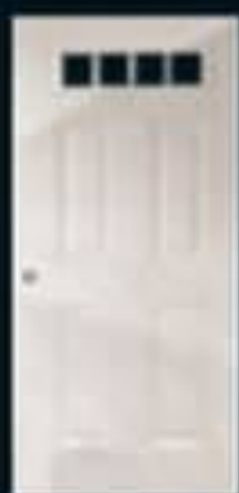
4-Lite 36" Door $350.00