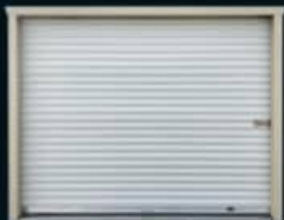
6' Roll-up Garage Door $525.00