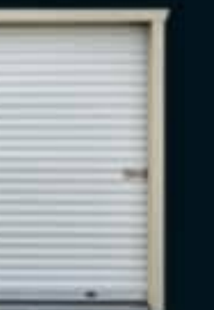
9' Roll-up Garage Door $575.00 (Exceptions Apply)