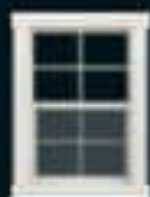
2'x3' Window $90.00