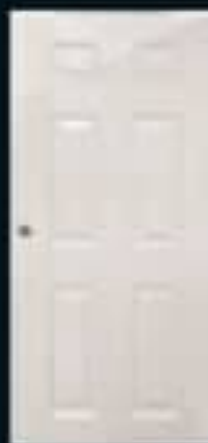
36" Solid Door $275.00