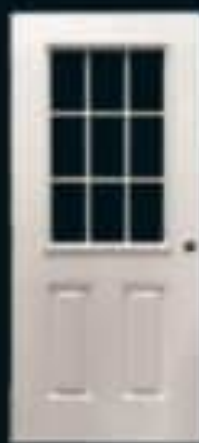
9-Lite 36" Door $325.00