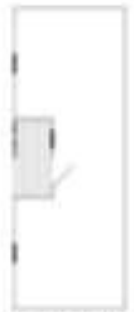
CC Floor Plan STANDARD